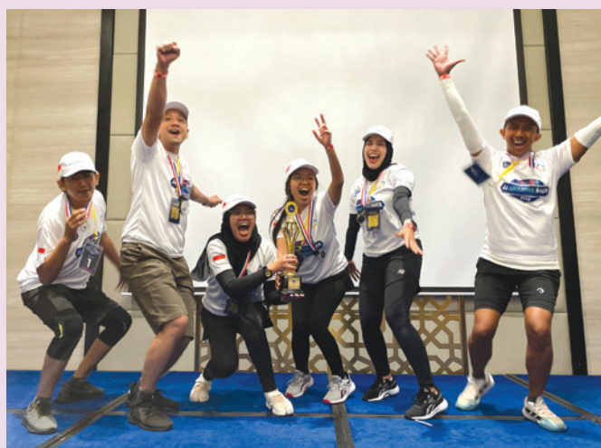
The winning team of the JJ Amazing Race accepting their trophy.

#Physical: Our calendar was filled with diverse fitness activities including Pilates, Zumba, Indoor Step, Laughing Yoga, Body Combat, Aerobics, and Aero Kickboxing, ensuring that there's something for everyone—and that everyone stayed active and energised!