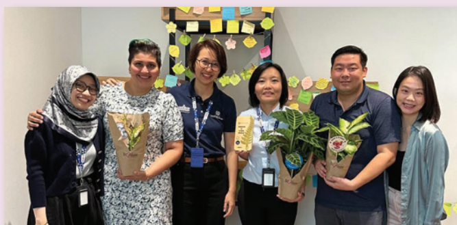
Winners from 'A Wall of Inspiration' activity organised by Malaysia Growth Mindset committee.

While the Growth Mindset is now clearly part of our people's daily behaviours, as a Group, we will continue reinforcing its importance and rewarding its use so as to embed it into our corporate culture.