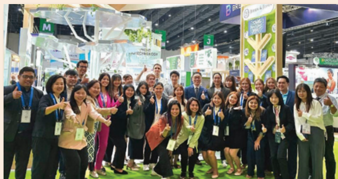
Jebsen & Jessen Ingredients Regional Sales Team from the Personal Care Department and co-exhibitors from Innovacos and LABIO at In-cosmetics Asia 2023.

Through these collaborative efforts, Jebsen & Jessen Ingredients continues to position itself as a key player in delivering advanced, sustainable personal care solutions, and an innovation leader in the industry.