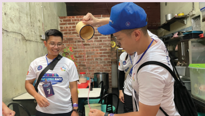
Participants during their "teh tarik" challenge.

#Social: The highlight of 2023 was undoubtedly the JJ Amazing Race, where teams competed in a series of exhilarating challenges, fostering camaraderie and team spirit along the way. This full-day event provided employees with the opportunity to bond outside of the workplace while flexing their physical and mental agility.