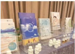
05/A Skin Tech Revolution