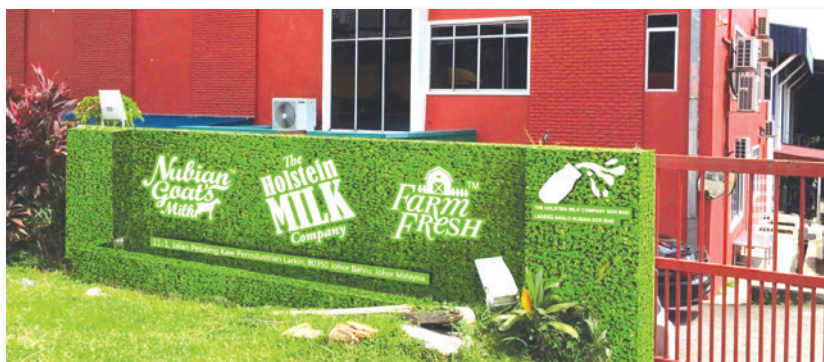
Farm Fresh factory in Johor, Malaysia.

This hard-won contract signifies a significant milestone and the beginning of a promising partnership between Farm Fresh and Jebsen & Jessen Packaging. It reflects our dedication to delivering excellence and our ability to provide tailored solutions to our customers.