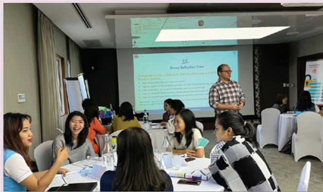
Myanmar participants exchanging ideas with one another during one of the group activities.