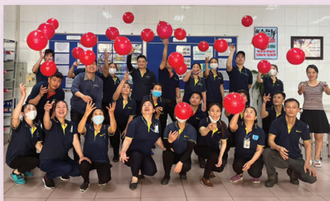
During the training for operative employees in Vietnam.

2023 also saw locally driven Growth Mindset activities across countries, where employees were invited to share their growth stories. The best stories were selected, and top Growth Mindset Champions crowned!