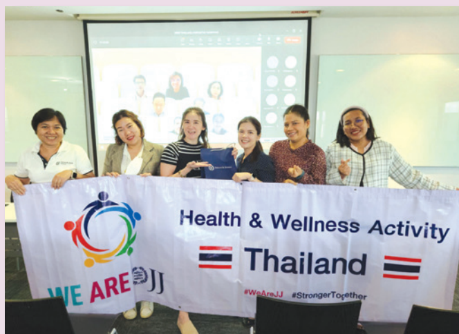
Mindfulness activity in Thailand.