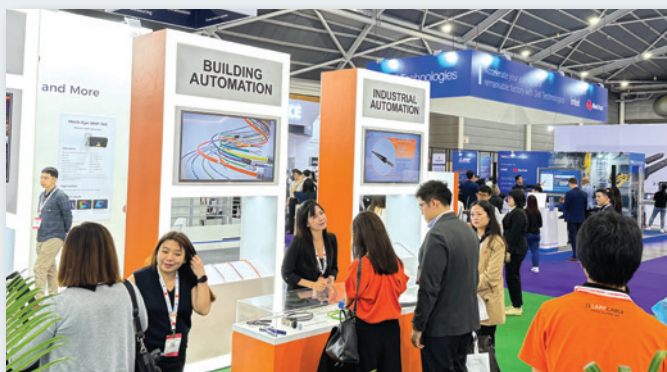
JJ-LAPP and LAPP teams showcasing the latest innovations at the ITAP 2023 exhibition.

Oct 2023 JJ-LAPP made its presence felt at the Industrial Transformation Asia-Pacific Exhibition (ITAP) 2023, held at the Singapore Expo from 18 to 20 October 2023.