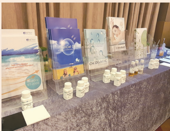
BioNest's cutting-edge sunscreen products on display at the seminar, highlighting the latest advancements in UV protection technology.

At in-cosmetics Asia 2023, a premier B2B platform for personal care ingredients in the Asia Pacific region, Jebsen & Jessen Ingredients stood out by partnering with Innovacos and LABIO. Our joint booth became a focal point for discussions on emerging trends and technologies, with as many as 26 product prototypes from our Regional Lab on display. Together with our partners, we were able to showcase our leadership in driving innovation within the personal care industry, while also forging new connections and nurturing existing partnerships.