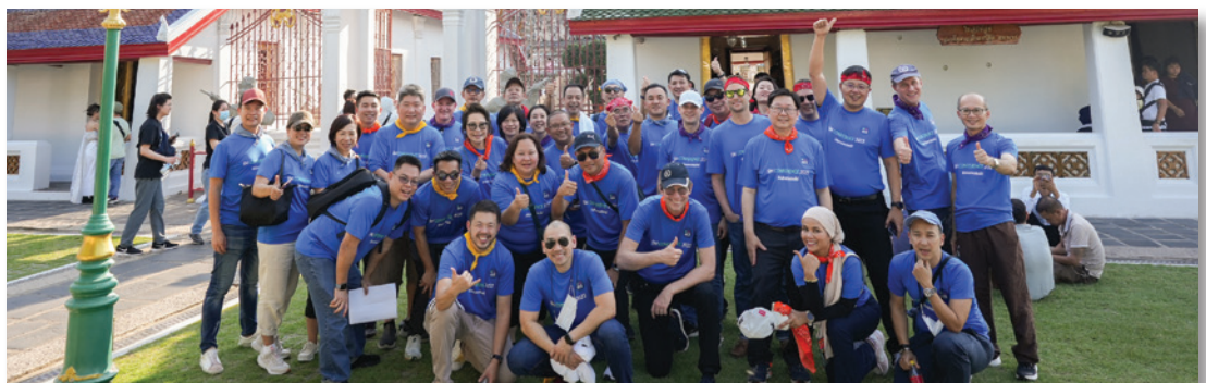
An enthusiastic senior management team looking forward to the next 60 years together.

Countless chapters lie ahead, built on our values of sustainability, entrepreneurship, innovation, and partnership. Within these pages, future-ready industrial companies emerge as architects of a more sustainable tomorrow for the next generation.