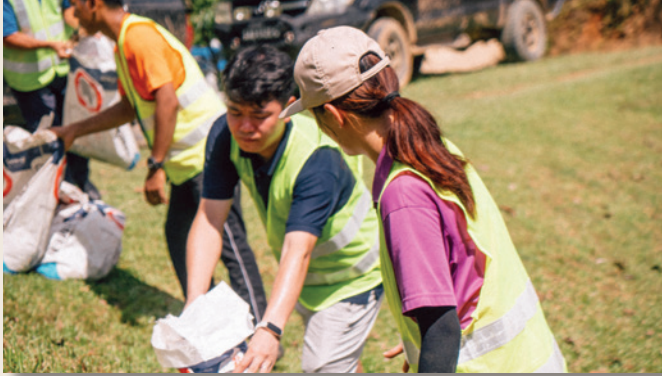
Volunteers transporting cement bags for building water tank foundations.

Nov 2023 Nestled in the lush landscapes of Sabah, Malaysia, is the village of Pekan Pensiangan. Beneath its serene façade, however, lay the challenge of accessing clean water—a fundamental necessity for its predominantly Orang Murut community. To meet this need, Jebsen & Jessen, in collaboration with EcoKnights, embarked on a mission to bring clean water to this remote village and change the lives of 30 resident families.