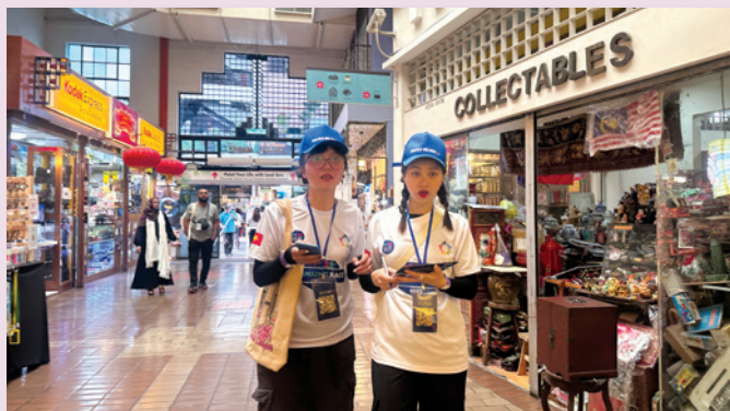
Participants during JJ Amazing Race looking for clues to lead them to the next challenge.