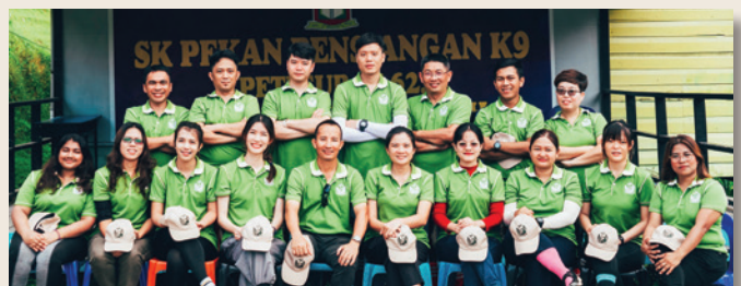
The group of 17 volunteers together at SK Pekan Pensiangan.