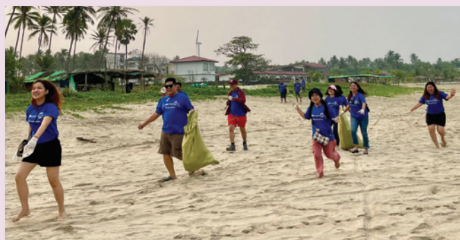
Colleagues in Myanmar during a beach clean-up.

#Financial: We continued to prioritise financial literacy by hosting workshops and talks aimed at enhancing employees' financial wellness, building upon previous years' efforts in this area.