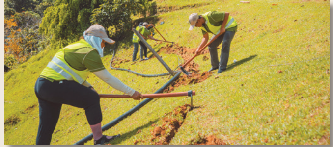
Volunteers digging canals to lay water pipes.

Beyond practical assistance, the expedition fostered cultural exchange and unity. Moments of joy and celebration punctuated the hard work, as volunteers and villagers shared meals, performances, and traditions.