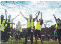
12/Water For Life