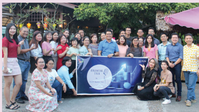
Myanmar team after a successful session of a financial talk.