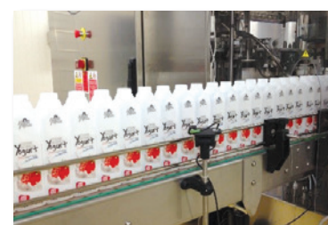
Jebsen & Jessen Packaging bottles on Farm Fresh's filling line.