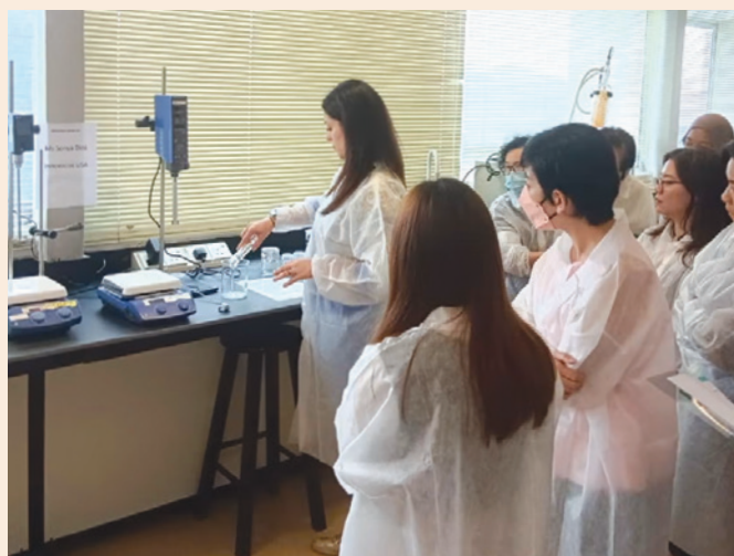
Innovacos technical expert leading a lab demonstration, offering customers an in-depth view of the science behind our sustainable beauty solutions.

In collaboration with BIO-NEST, we held a successful "Next Generation of Skin Care & Sunscreen" seminar in Thailand. The seminar was effective in demonstrating our commitment to engaging industry players while showcasing cutting-edge technologies such as BIO-NEST's encapsulation technology, which stabilises the chemical UV filter in sunscreens to ensure a long-lasting and consistent sun protection factor (SPF). The seminar attracted a diverse professional audience, eager to explore the future of skincare and sun protection. This further elevated our brand reputation and cemented BIO-NEST as the market leader in innovative and high-quality cosmetic ingredients.