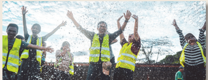
Volunteers rejoice as water finally flows through the pipes.

Reflecting on this transformative experience, our volunteers recount not just memories but a profound sense of fulfilment. Their accomplishment at Pekan Pensiangan is testament that with compassion, collective action, and determination, each one of us can contribute to a brighter tomorrow for everyone.