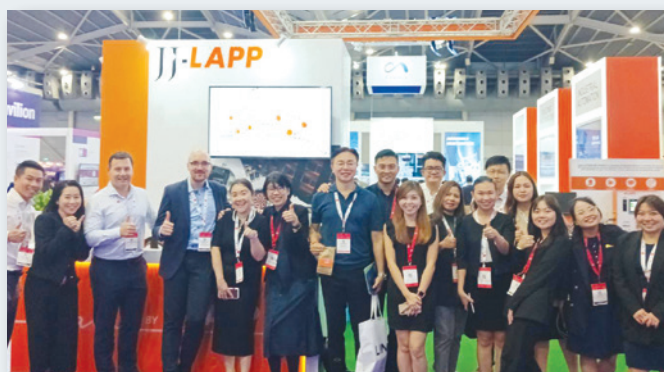
JJ-LAPP and LAPP teams at ITAP 2023.

ITAP 2023 is an industrial development specialised trade fair and an event of HANNOVER MESSE, the world's leading trade show for industrial technology. Bringing together over 18,000 global Industry 4.0 leaders, solution providers, and delegates, ITAP 2023