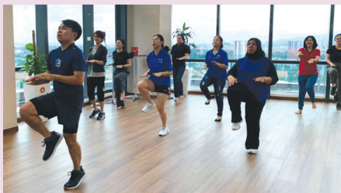
Colleagues in Malaysia participating in a Tabata session.

#Mindfulness: A webinar titled "Healthy Mind Toolkit: Boosting Your Mental Health," was organised by our Health & Wellness Committees in Singapore and the Philippines in collaboration with EHS and Workplace Options. This attracted approximately 300 participants from across the region, who each gained valuable insights and practical tools for practicing mindfulness in their daily lives.