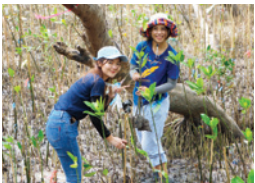
08/Stronger and Happier