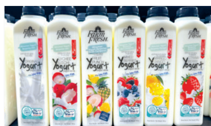
Farm Fresh milk in Jebsen & Jessen Packaging bottles on store shelves.