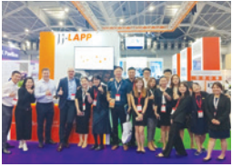
02/A Global Stage