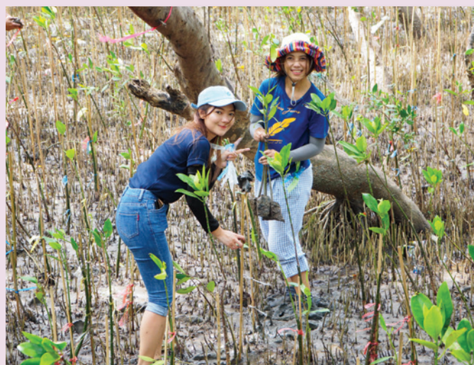
Colleagues in Thailand during mangrove tree planting.

Looking back at 2023, these are some of the highlights that our people enjoyed!