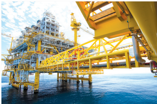
Operating platform in deep water up to 520m, anchored by concrete legs to the ocean floor.

Dec 2023 In 22 years, Cables International has grown to become the world's leading supplier of specialty cables for the marine and offshore sectors. This has been driven, in part, by its many partnerships with major manufacturers such as Prysmian Group, TMC Cables, Teknikabel, APS Finland, Ellis Patents, Eaton, and