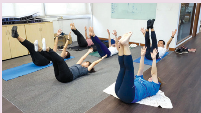
Our colleagues in Singapore engaged in a yoga session.