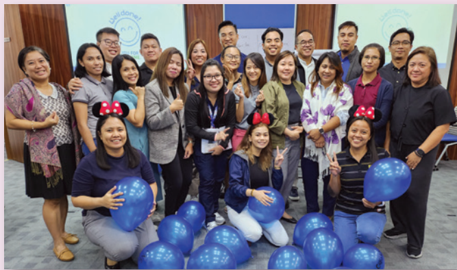
Group photo of Growth Mindset class in the Philippines.